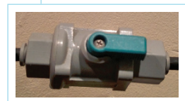
Emergency water shut-off

After the installation is complete, the technician performs a multi-point inspection, including checking all lines and tanks, cold and hot water temperature settings, de-scaling ice machines and ice production, carbonation levels, and taste.